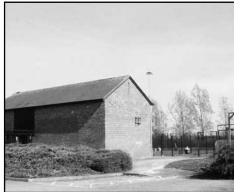
Downs Barn Pavilion.

S ports facilities and pavilions maintained by Great Linford Parish Council can, and are, hired by many different sports clubs and community groups. Facilities include the multi-sport facility and pavilion at Downs Barn (left), the sports facility at Marsh Drive, and cricket ground and pavilion at High Street, Great Linford. The tennis courts are used by Great Linford Tennis Club (see page seven for more information).