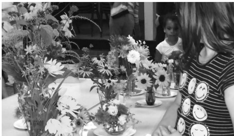
Blooming lovely - a scene from last year's Allotment Association Produce Show.