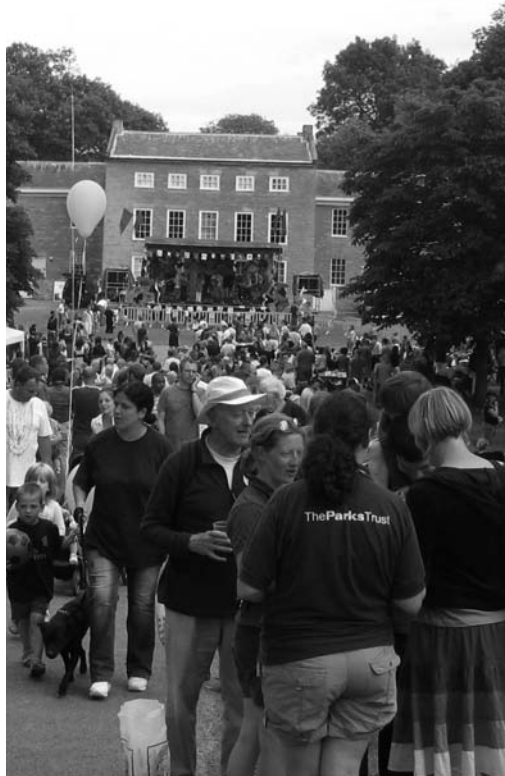
Fun and family meet at the Waterside Festival (above) while the Dog Show (below) makes a welcome return to the event this year.

There will also be canal boat rides, junior football matches, a variety of dancing displays, art workshops, craft stalls, charity stalls and sideshows, fairground rides, bouncy castle, historical walk and a full programme in St Andrew's Church. When you have worked up an appetite after that, there is to be a barbeque, beer tent, ice cream and other great food available. The Dog Show will make a welcome return on the Sunday June 21 st . All events take place in the grounds of Great Linford Manor Park. To keep admission to the event free and in response to increasing costs, there will be a nominal fee for the use of our car parking areas. For more information visit the official Waterside Festival website at www.watersidefestival.co.uk