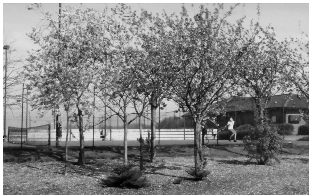
The tennis courts at Marsh Drive, Great Linford.