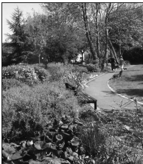
A GLPC grant helped to create and maintain the border (above) in Great Linford High Street.