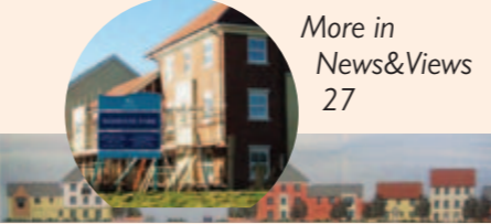
More in News&Views 27

After four years discussion and with the agreement of Haversham & Little Linford PC, MKC finally agreed Redhouse Park would be incorporated into Great Linford parish from April 2011.