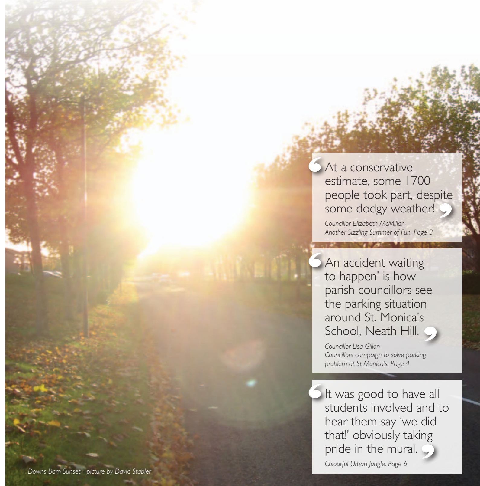
Downs Barn Sunset